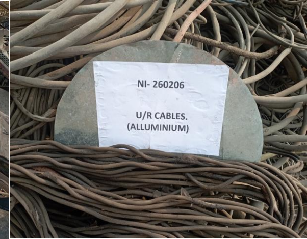
U/R CABLES. (ALLUMINIUM)

All the above pictures are indicative in nature (for understanding purpose only. Actual lot photos will be available at the time of live auction)