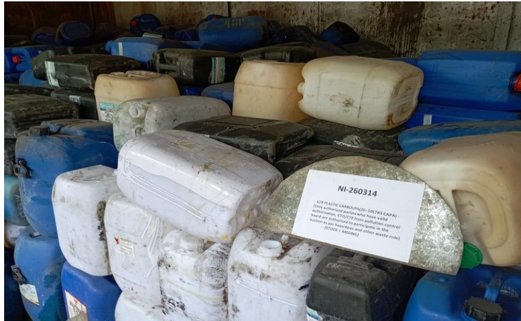
U/R PLASTIC CARBOUYIS (20- 50LTRS CAPA)