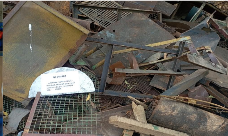
U/R MISC. SCRAP ITEMS - Incl duct, channel, pipe, tank structure (sugar hooper) & ETC