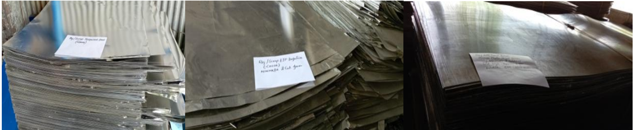
Rej and Scrap Tempered Sheet (Loose)